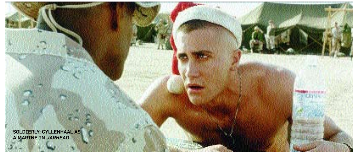
SOLDIERLY: GYLLENHAAL AS A MARINE IN JARHEAD